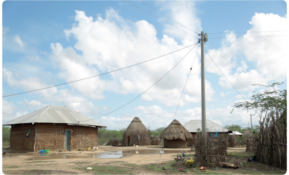
Electrified homes in Tana River

The Corporation has kicked off a massive electrification project in Tana River County which when completed will connect homes, business premises and public facilities to the grid in three constituencies in the county. The project is expected to be completed by June 2022.